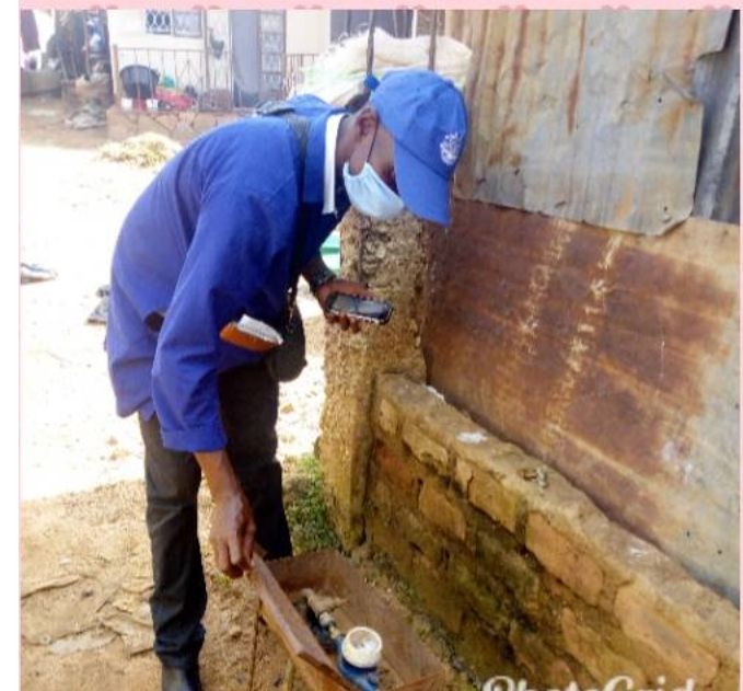
NWSC Staff have been provided with the necessary protective gear